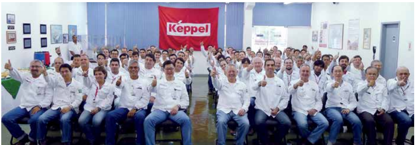
Keppelites from all over the world, such as those at BrasFELS in Brazil, tuned into the Global Keppelites Forum via webcast