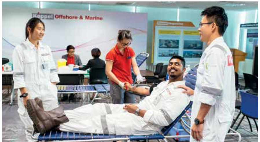
Keppelites give the gift of life, donating nearly 400 bags of blood in a drive organised by Keppel Volunteers and the Red Cross

At a separate Christmas party on 12 December 2015, 18 Keppel Volunteers and 75 elderly from Bedok THK ushered in the