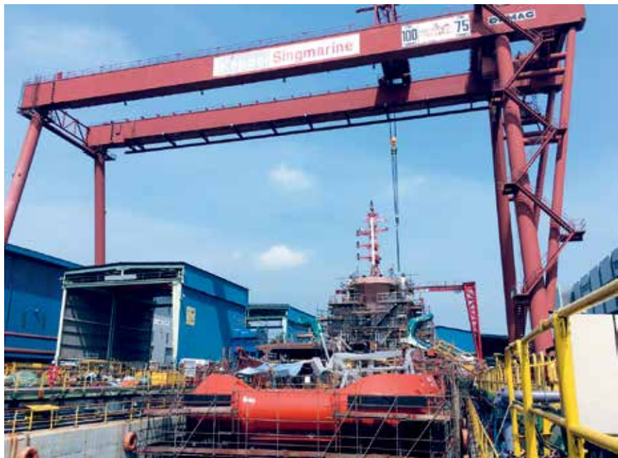
When completed in 2Q 2016, the vessel will be the fifth AHT unit that Keppel Singmarine has built for Seaways

have a designed bollard pull of 120 tonnes. It will be equipped with Class 1 and 2 fire-fighting capabilities, dynamic positioning systems Class 2, and oil recovery Class 1 capabilities, amongst a host of other equipment.