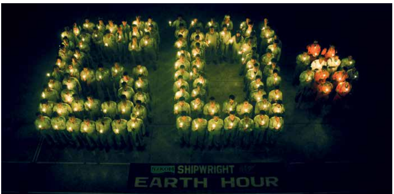
Committed to protecting the environment, Keppel O&M ensures energy efficiency in its operations in order to reduce its carbon footprint

In line with the Group's goal to reduce carbon emissions, Keppel O&M organised an inaugural Keppel O&M Energy Saving Initiatives Workshop in the beginning of 2015. The workshop aims to provide a platform for Keppel O&M to consolidate its energy-saving ideas and for all levels of management and teams to pledge their commitment to drive and cascade these ideas across the group.