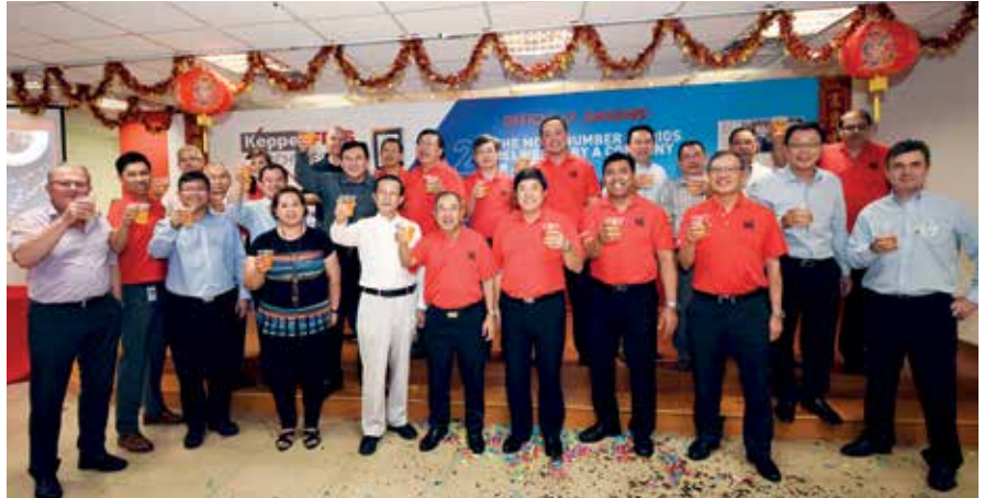
FELS toasted to a new year of prosperity and good fortune at the Lunar New Year celebrations on 5 February 2016

Besides being treated to a lion dance performance, guests also enjoyed delicious food, fun games,