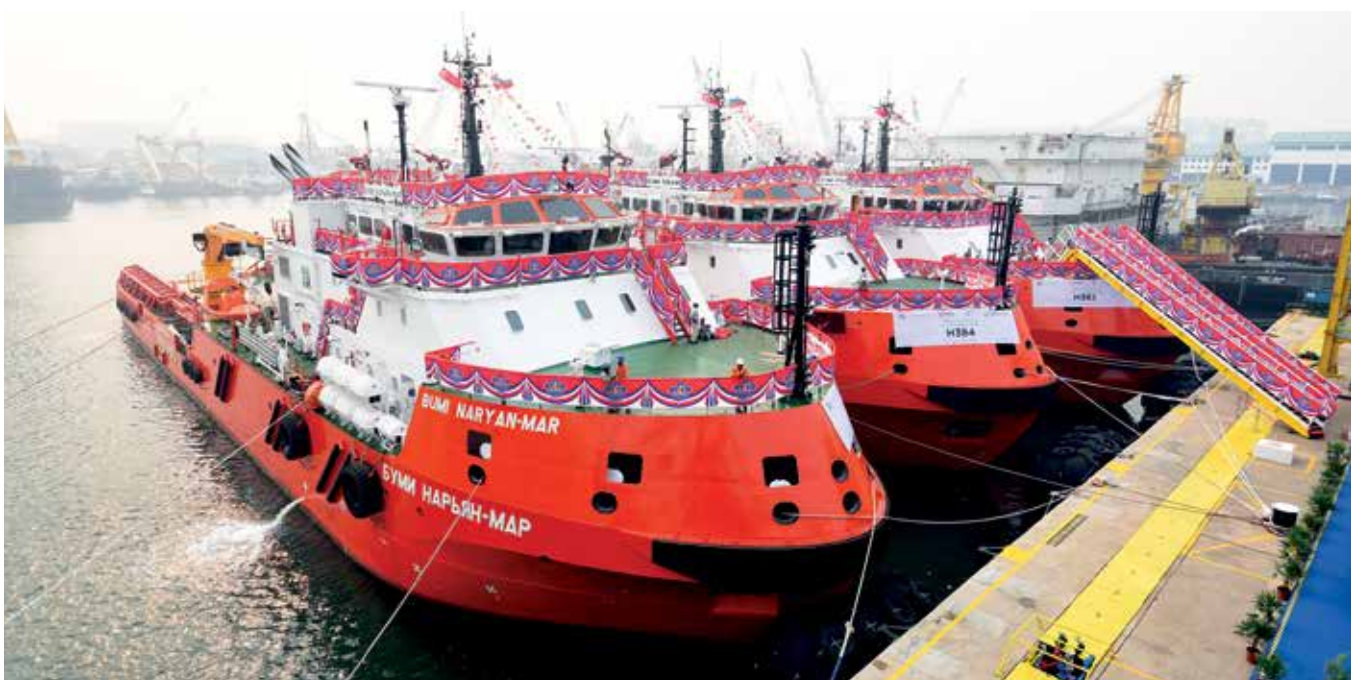
Keppel Singmarine successfully delivered two ice-class supply vessels and one ice-class multi-purpose duty-rescue vessel to Bumi Armada in September 2015

Reinforcing its position as an industry leader in the design and construction of specialised vessels, Keppel Singmarine is currently constructing a multi-purpose vessel for New Orient Marine Pte Ltd, a subsidiary of Luxembourg-based Maritime Construction Services SA.