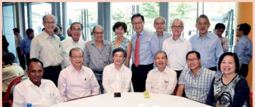
It was an afternoon to remember as members of KOM alumni caught up with old colleagues and friends over tea