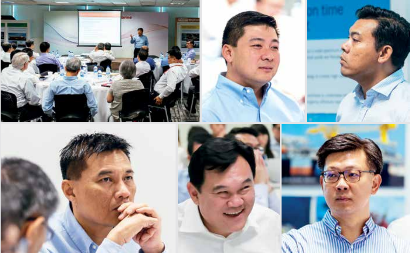
Great minds from across Keppel O&M engaging in discussions at the strategy meeting in February 2016 on how the company can continue to forge ahead in the longer term amidst a downturn

With the headwinds facing the offshore and marine industry, the management team from across Keppel Offshore & Marine's (Keppel O&M) yards and offices worldwide had much to discuss as they gathered in Singapore for the Group's biannual strategy meeting.