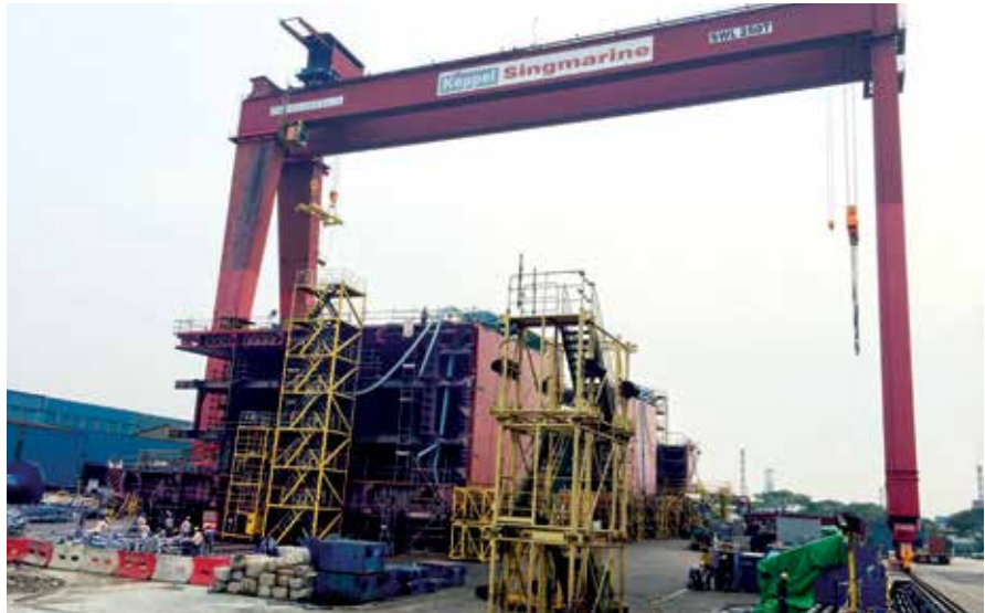
The multi-purpose vessel that Keppel Singmarine is building is currently under construction in the slipway and scheduled to be launched in 2H 2016

Suitable for an array of offshore activities, the AHT vessel will