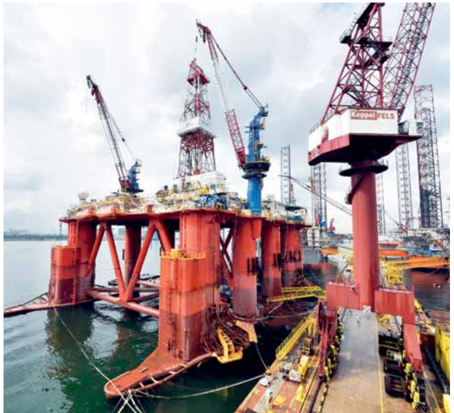
Semisubmersible drilling rig Hakuryu-5 made a repeat visit to Keppel FELS in November 2015 for repair and refurbishment work

A long-time partner of JDC, Keppel FELS has collaborated with JDC on other repair projects, including Hakuryu-10, Hakuryu-11 and NAGA 1.