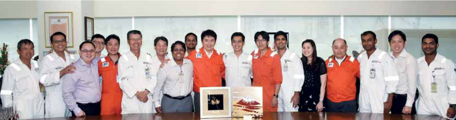
Project management teams from Keppel FELS and Japan Drilling Co. celebrated yet another win-win partnership during the re-delivery signing of Hakuryu-5

Keppel FELS celebrated the re-delivery of the Hakuryu-5 semisubmersible drilling rig to Japan Drilling Co. (JDC) on 2 February 2016.