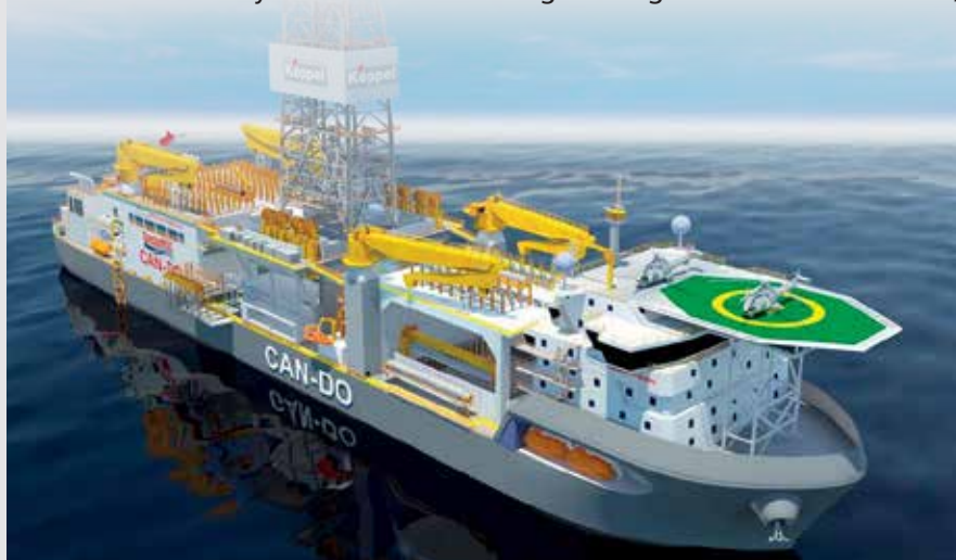
The Keppel O&M Houston unit is at the forefront of advancing technology and exploring opportunities in current and new markets such as drillships, subsea systems and LNG solutions.