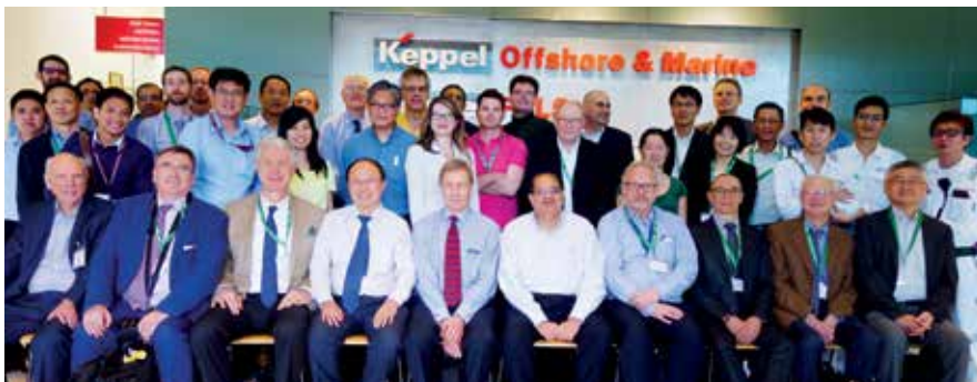
Delegates from the ISO Technical Committee for Offshore Structures exchanged ideas on how technological innovations can improve work processes in the offshore and marine industry during their visit to Keppel Offshore & Marine

Following a robust discussion on production and engineering automation, the delegates toured the yard to better understand operations within the facility.