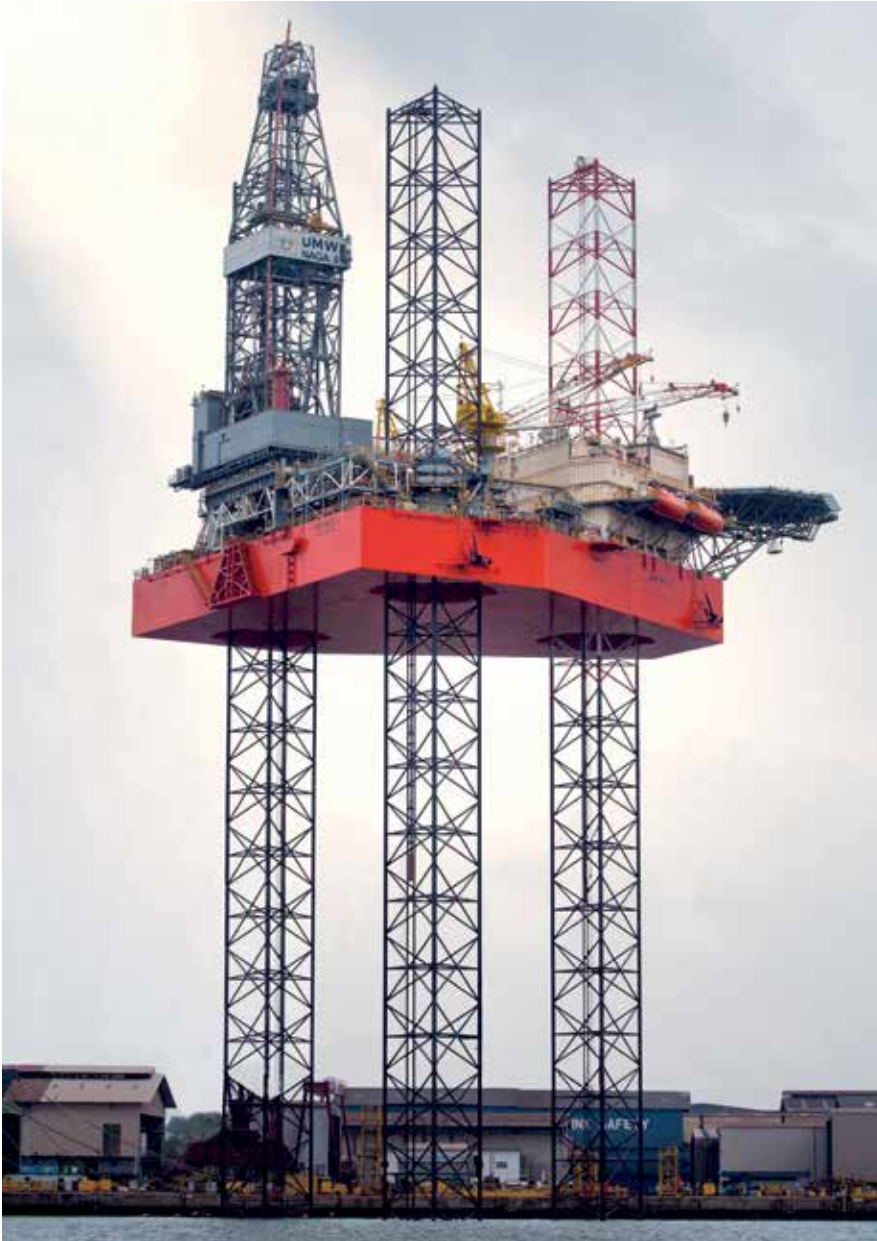
Keppel Offshore & Marine delivered seven jackup rigs to clients in 2015, including UMW Naga 8 (pictured)