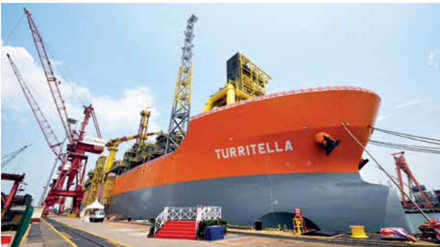
Keppel Offshore & Marine delivered several non-drilling solutions to its customers throughout the year, including the FPSO Turritella (pictured) to SBM Offshore

Even as we work at reducing costs and optimising current operations, we are still investing prudently in R&D as well as improving on our productivity and core competencies. During the