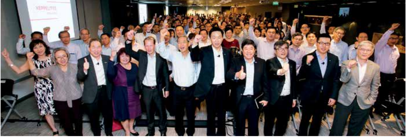
Senior management together with Keppelites at the Global Keppelites Forum 2016 held at the Keppel Leadership Institute

the forum gave him a broader perspective of Keppel's Brazil operations in the context of the Group's multi-business strategy.