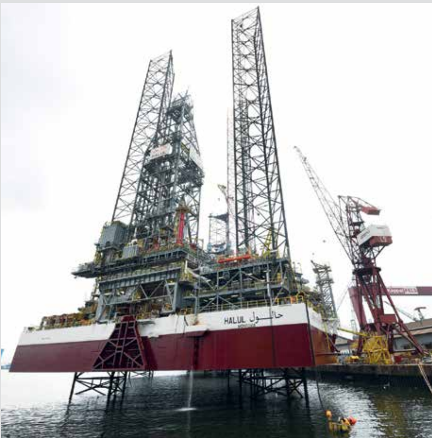
Halul was completed 10 days ahead of schedule, on budget and with a perfect safety record. It will be the fifth KFELS B Class jackup rig to work for Gulf Drilling International