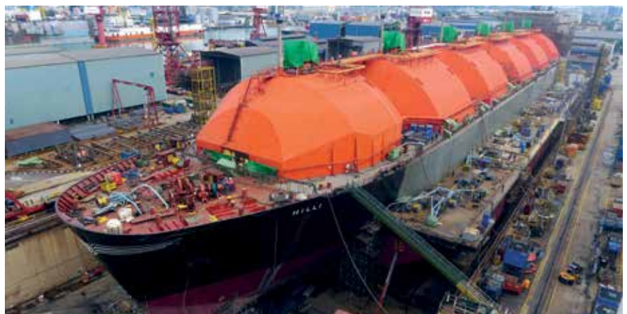
The conversion of LNG Carrier, Hilli, by Keppel Shipyard into an FLNG vessel is progressing well and is about 68% completed to date