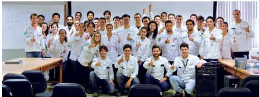
The inaugural sharing session organised by BrasFELS' Alumni Programme saw a strong turnout, comprising of BrasFELS employees who are undergoing the two-year Trainee Engineers Programme as well as graduates of the programme