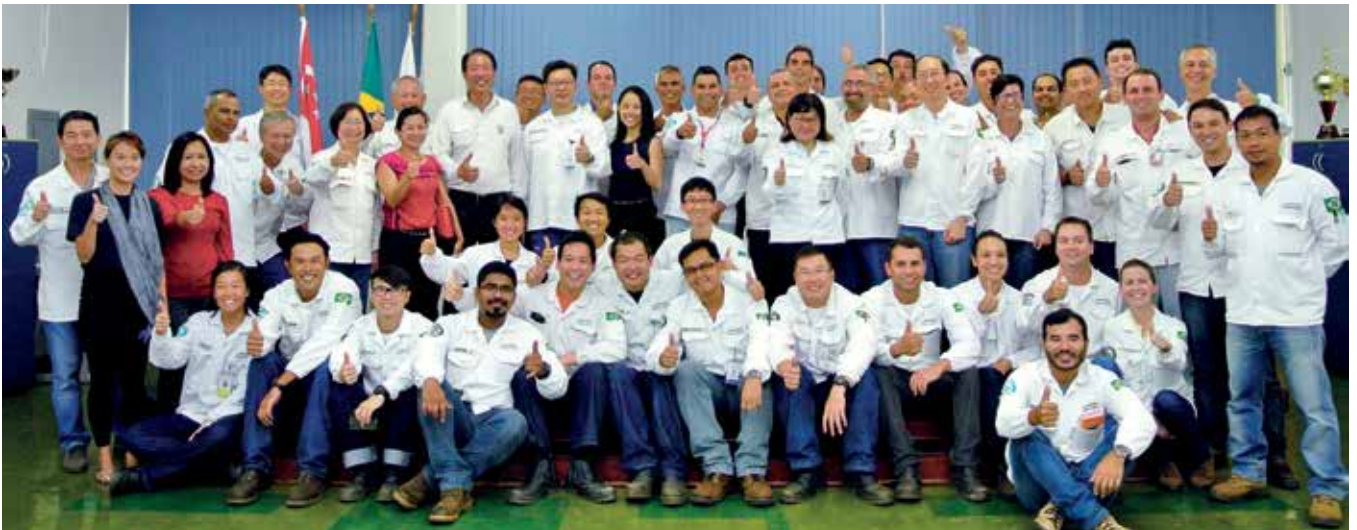
DPM Teo met with BrasFELS employees, including Singaporean employees who have been seconded to Brazil as well as Brazilian employees who have undergone training or attachment programmes in Singapore