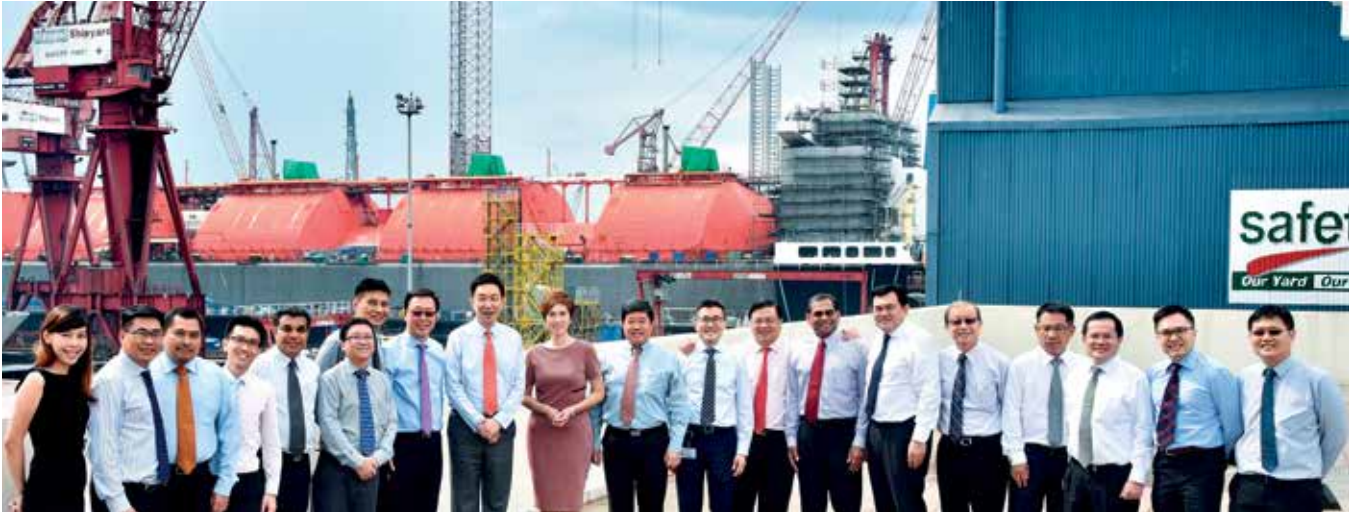
Senior Minister of State in the Prime Minister's Office, Ministry of Foreign Affairs and Ministry of Transport, Mrs Josephine Teo (centre, in dress), delegates from the Ministry of Transport, the Maritime and Port Authority of Singapore and Keppel senior management posing for a group picture with the Floating Liquefaction Vessel, GoFLNG Hilli (background), which is at Keppel Shipyard for conversion works

As a leading provider of offshore and marine solutions globally, Keppel Offshore & Marine (Keppel O&M) is poised to seize Liquefied Natural Gas (LNG) development opportunities in the region. Its ship repair and conversion unit, Keppel Shipyard, has a long track record of catering to the LNG market, and was the first shipyard in the world to provide conversion solutions for a Floating Liquefaction Vessel in 2014.