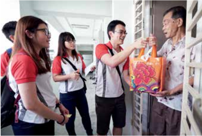
Keppel Volunteers brought bagfuls of cheer to those in need by delivering Fu Dai (festive packages)