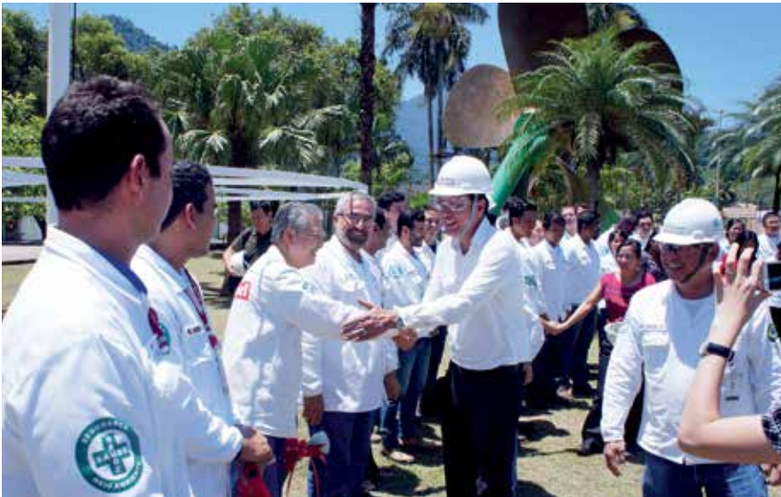
During his visit, DPM Teo and his delegation toured the BrasFELS yard to better understand yard operations and also chatted with employees to get a glimpse of their lives in Angra Dos Reis, Brazil

To commemorate the occasion, DPM Teo planted a Pau-Brasil tree within the shipyard's grounds. Symbolic of Brazil's abundant natural resources, Pau-Brasil is the tree from which Brazil derives its name.