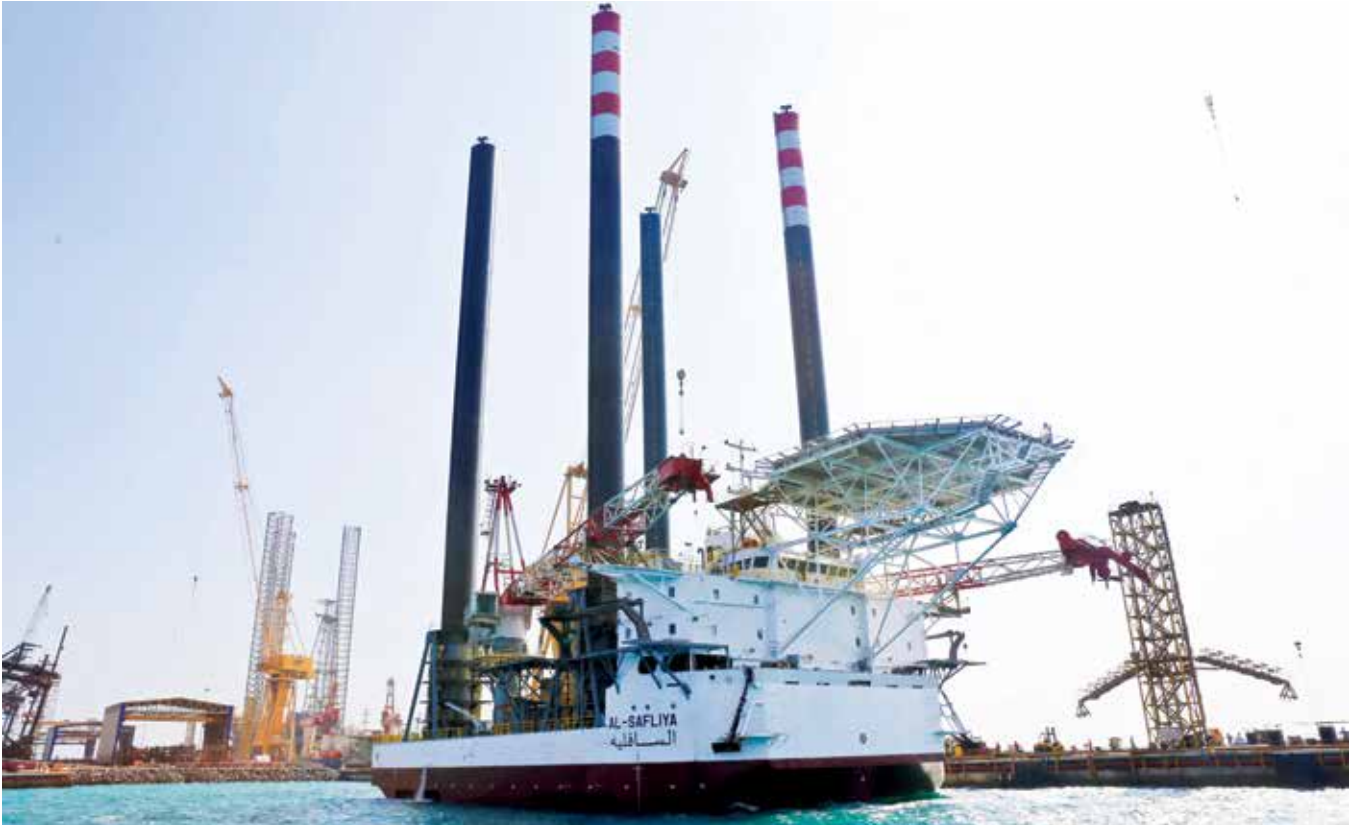
Al Safliya, the first liftboat to be wholly constructed in Qatar, is built to the ORCA 2500 design developed by Keppel O&M's design arm, Bennett Offshore

Nakilat-Keppel Offshore & Marine (N-KOM), the joint venture shipyard between Qatar's Nakilat and Keppel Offshore & Marine (Keppel O&M), successfully delivered on 12 January 2016 its first liftboat unit, Al Safliya, to Qatari rig operator Gulf Drilling International (GDI), subsidiary of Gulf International Services, in a safe and timely manner without any lost-time incidents.