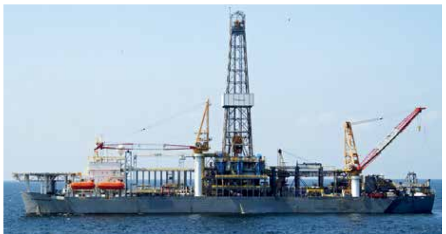
BrasFELS provided safe and efficient offshore support for Transocean's drillship rig Deepwater Navigator (pictured)

The drillship was at Bananal Bay over a period of 12 days from 30 December to 10 January 2016, during which BrasFELS extended safe and efficient logistics support for materials and equipment to Deepwater Navigator.