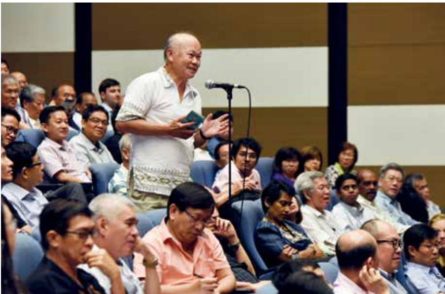
The question and answer segment of the lecture saw a wide variety of questions raised as members of the audience discussed the future of the offshore and marine industry

“To remain competitive, we must be able to adjust and adapt well in the changing environment we find ourselves in.”