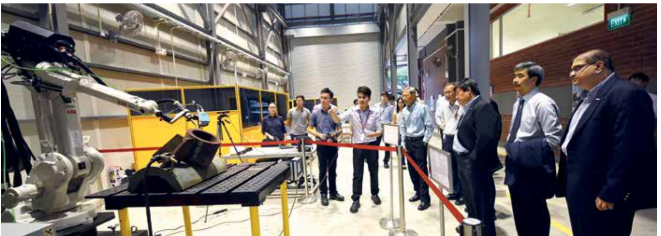
Keppel O&M management visiting the newly opened robotics and automation workshop by Keppel-NUS Corporate Laboratory that looks into productivity enhancement of yard operations

Leveraging the expertise of NUS research centres such as the NUS Centre for Offshore Research & Engineering and NUS Tropical Marine Science Institute, as well as Keppel's research unit Keppel Offshore & Marine Technology Centre, the Corporate Laboratory will develop capabilities and technologies to maintain Singapore's position as a global leader in the offshore and marine industry.