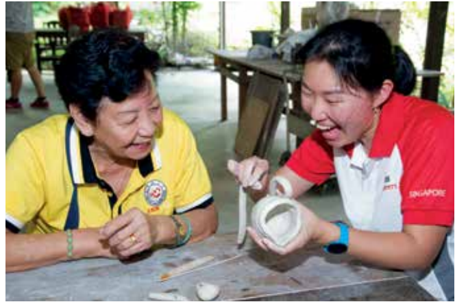
Keppel Volunteers and elderly beneficiaries cultivated creative skills and friendship at a ceramic workshop

The blood donation drive spanned five days and five locations, including new outreach venues such as Arcadia Lodge.