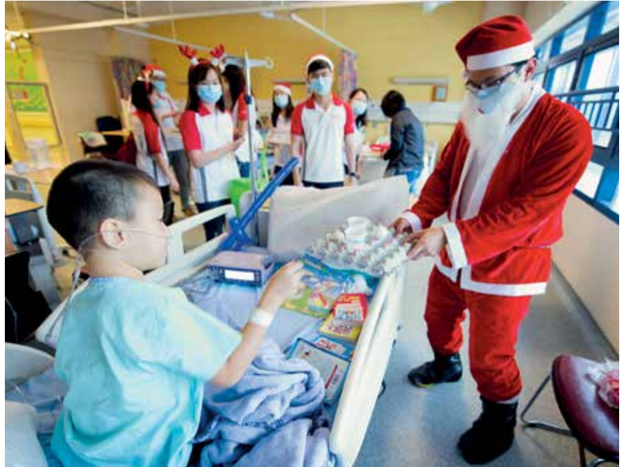
Keppel Volunteers play Santa and elves to bring festive cheer to children at the KK Women's and Children's Hospital

When Santa arrived together with 21 Keppelites to bring festive cheer at the KK Women's and Children's Hospital on 11 December 2015, he found only nice children all around. The visit, organised by Keppel Volunteers, brought an afternoon filled with presents and balloon sculpting to children aged one to 14 and their families at five wards in the hospital.